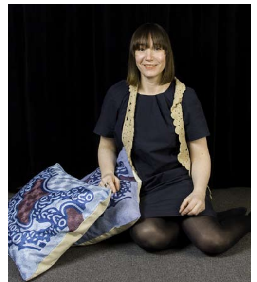
Cushions, I+I carpets, 2008

Favorite material and color: I don't have a favorite material. It all depends on the idea.