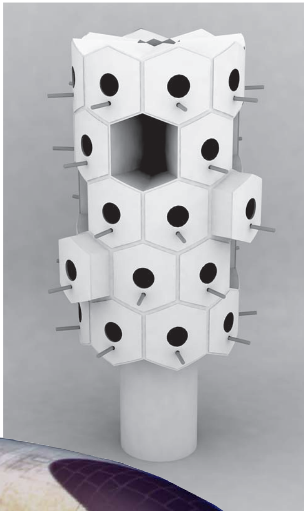
The Seascraper, The Bird House Project, 2007