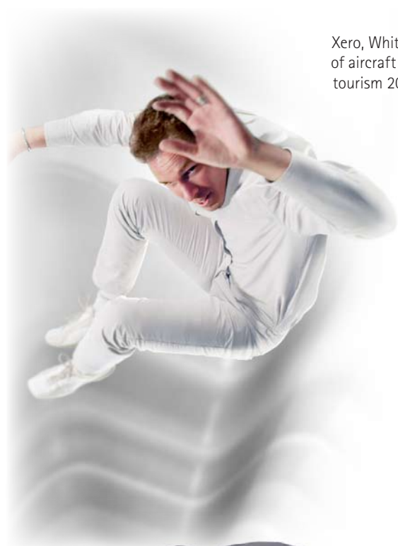
Xero, White, Interior of aircraft for Space tourism 2003–2004