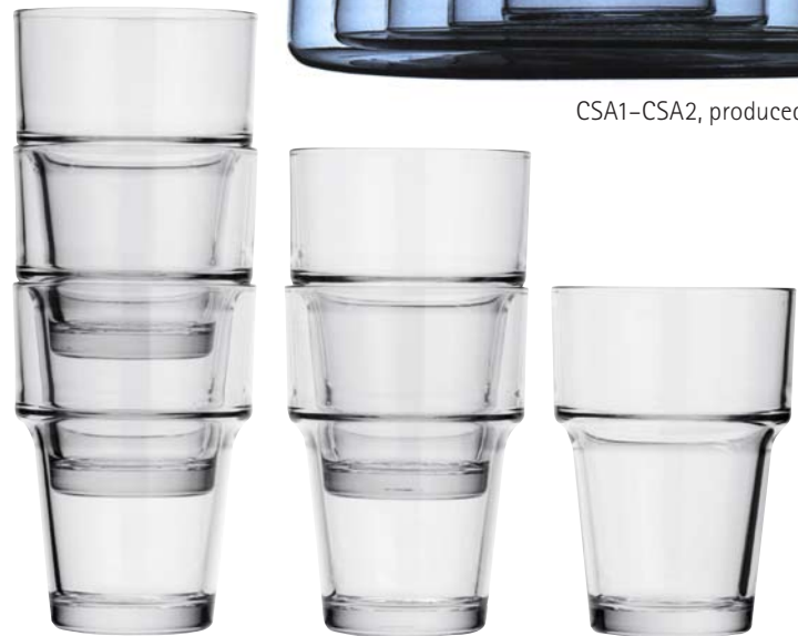
CSA1-CSA2, produced by CBI, 1996