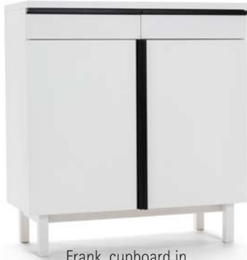
Frank, cupboard in birch-wood, produced by NC-Möbler, 2007