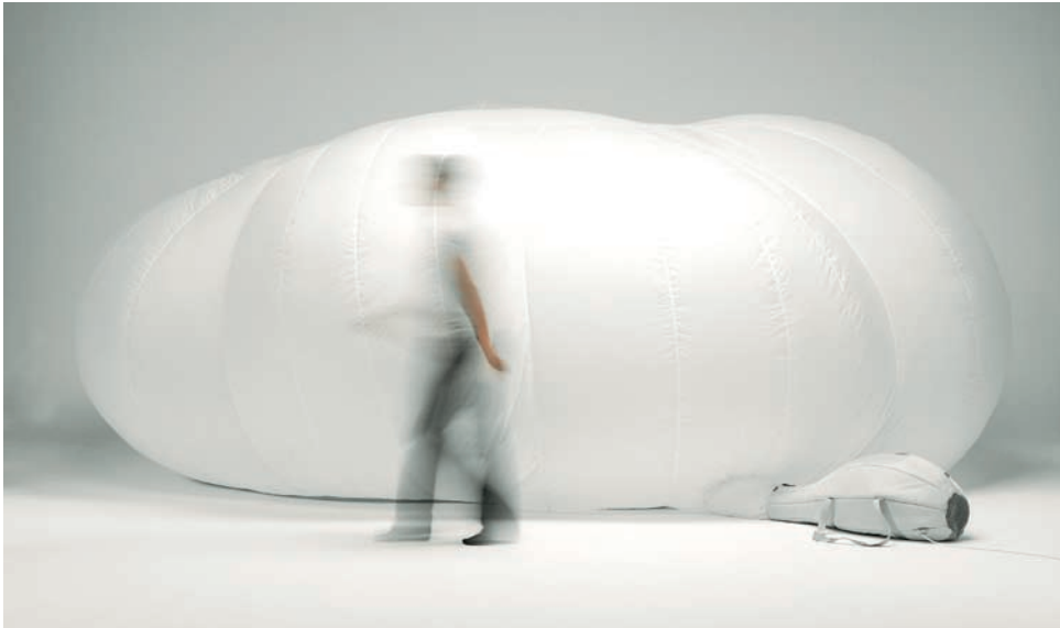
Cloud, developed by Snowcrash, produced by Offecct, 2003