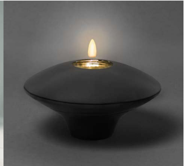
Flame, produced by Design House Stockholm, 2008