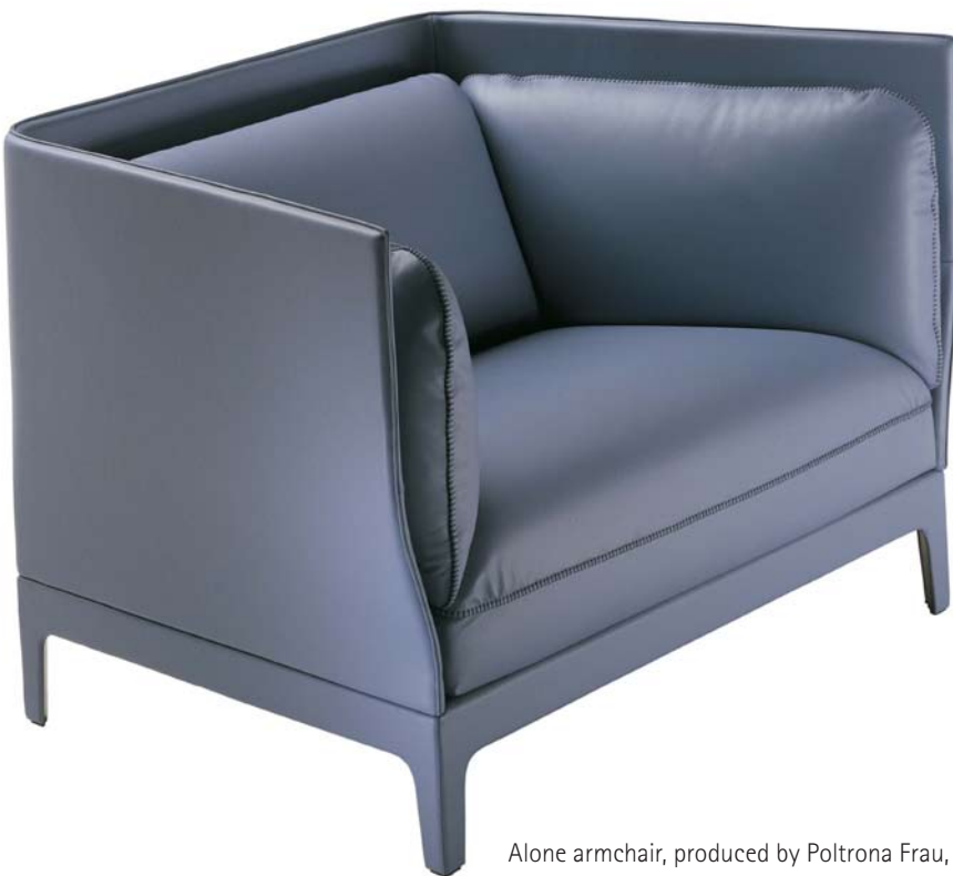
Alone armchair, produced by Poltrona Frau, 2007