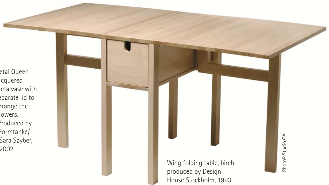
Wing folding table, birch produced by Design House Stockholm, 1993