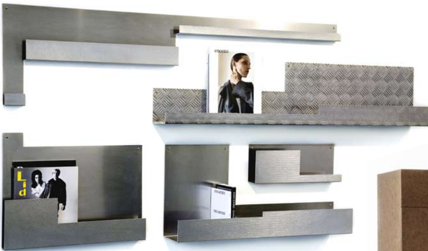
Sheet metal shelf, 2008