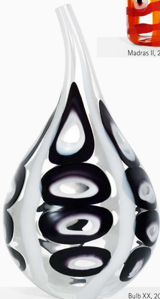
Bulb XX, 2006