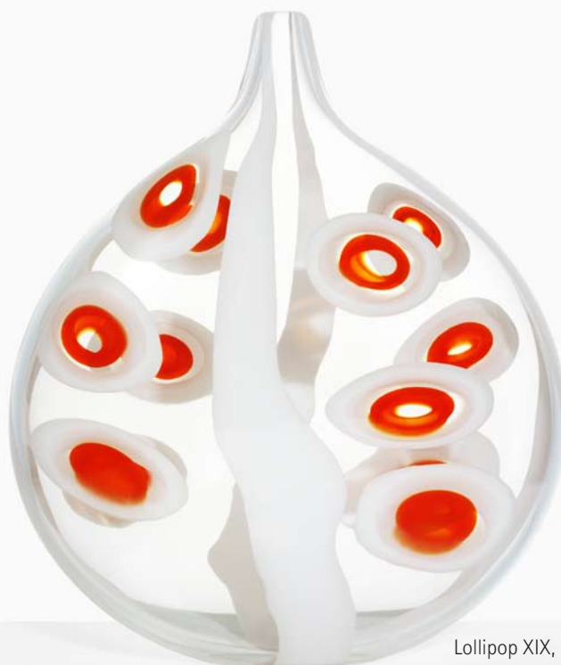
Lollipop XIX, 2006