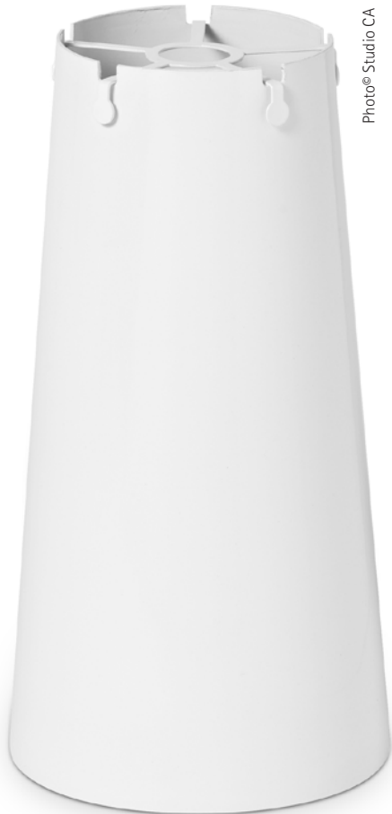
Metal Queen Lacquered metalvase with separate lid to arrange the flowers. Produced by Formtanke/ Sara Szyber, 2002