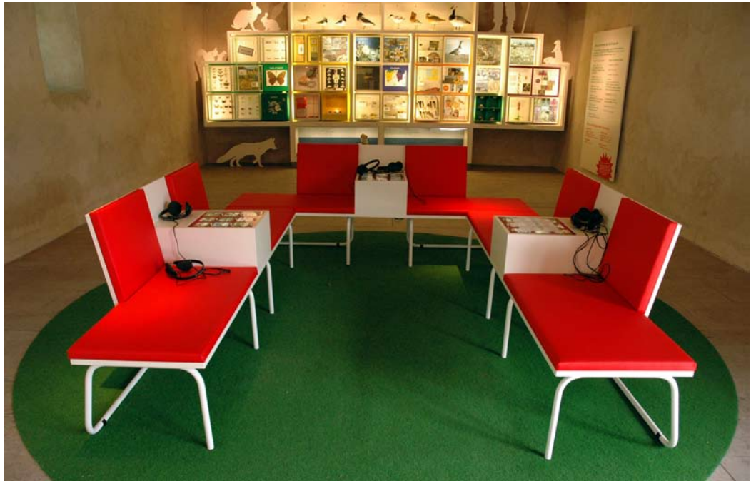
Gotlands naturrum, Interior design for a permanent exhibition about Gotland's nature. Produced by Gotland Municipal County, 2005