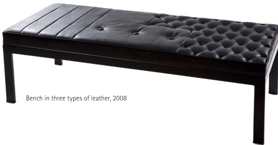
Bench in three types of leather, 2008