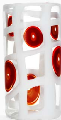
Madras VII, 2006