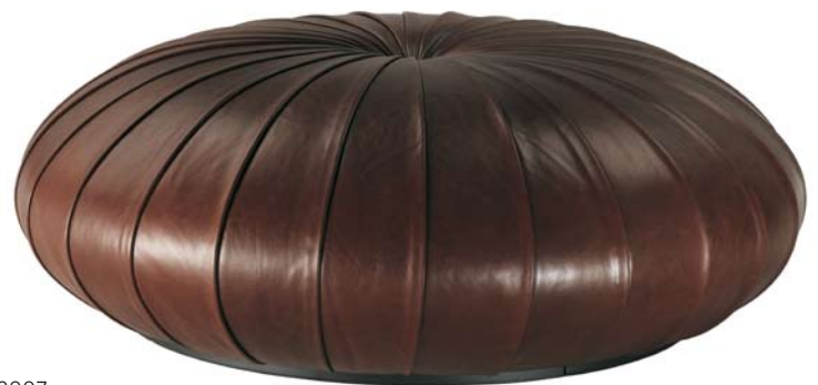
Esedra pouf, produced by Poltrona Frau, 2007