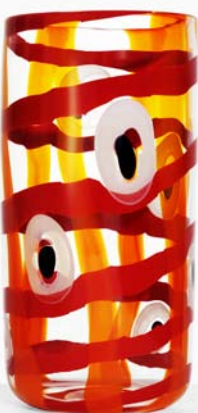
Madras II, 2006