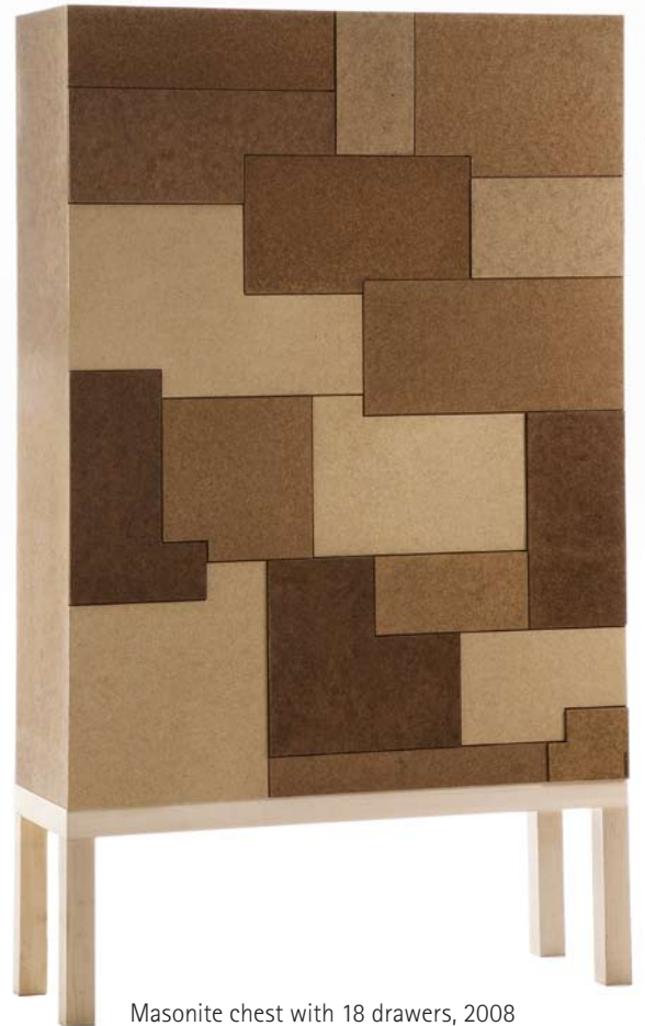
Masonite chest with 18 drawers, 2008