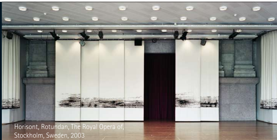
Horisont, Rotundan, The Royal Opera of, Stockholm, Sweden, 2003